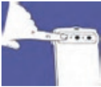
Instant Open/Close Shut-off Valve

“A home with a record of water claims may be uninsurable!” (MONEY Magazine 2003)